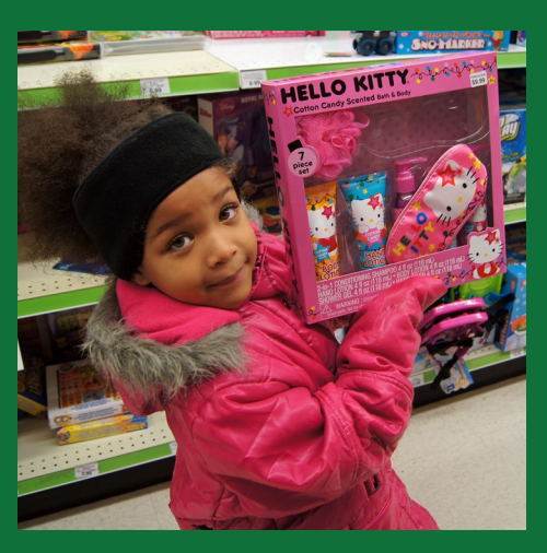
(above and rt.) Smith Homes families enjoy shopping for Christmas gifts at Toys R Us.